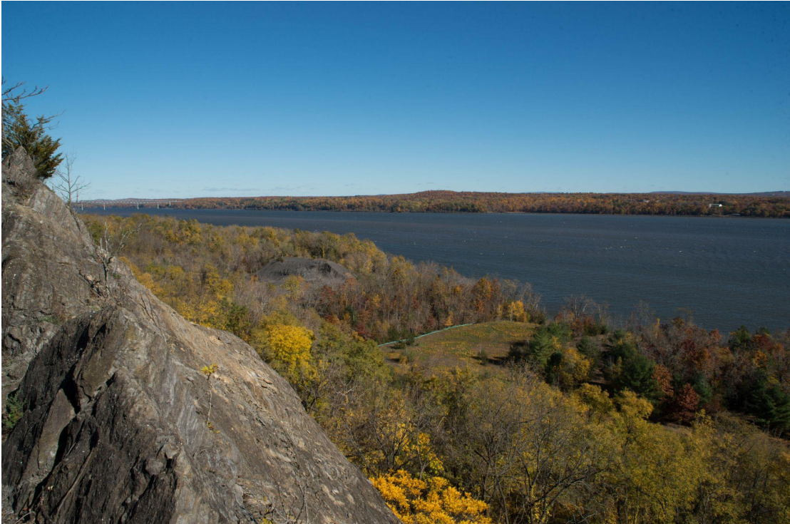
Photo of the Hudson River from Strategic Roadmap Stakeholder Survey